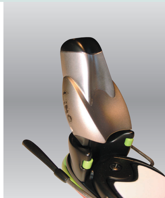
Master Surfacing provides lofting, sweeping and blending capabilities which allow associative feature-based definition of extremely complex geometry.